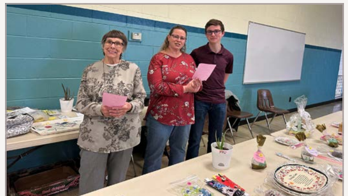
The Palm Sunday Bake & Craft Sale hosted by the Altar Rosary Society made $623.70! Thank you.